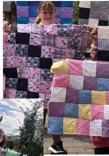
More camp photos.