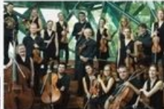
Melbourne Chamber Orchestra